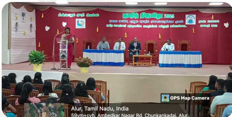
Alur, Tamil Nadu, India 59vm+cvh, Ambedkar Nagar Rd, Chunkankadai, Alur,